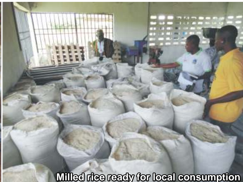
Milled rice ready for local consumption