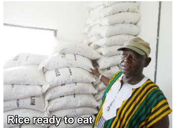
Rice ready to eat

According to the government, the six main strategic components of LNRDS include (i) Land and water management, (ii) Increasing availability and accessibility of smallholder farmers to farm