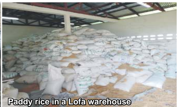
Paddy rice in a Lofa warehouse

Can Liberia produce enough food to feed its nearly 4 million citizens? The answer to that question may not be a resounding 'yes' for now. There are still hurdles! But the prospects are certainly improving. While the country is blessed with an excellent climate favorable to agriculture, extensive biodiversity, and vast natural resources, decades of war obviously ravaged Liberia's productive assets.