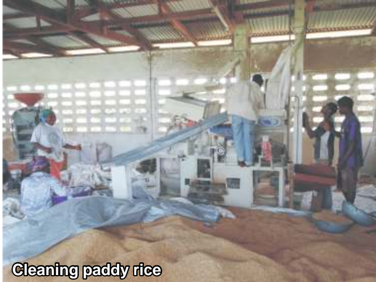
Cleaning paddy rice

Four years ago in 2008, when security forces stopped a truck carrying about 700 bags of rice at the Guinea border, the Ellen Johnson Sirleaf led government banned all food exports, particularly rice, because profiteers