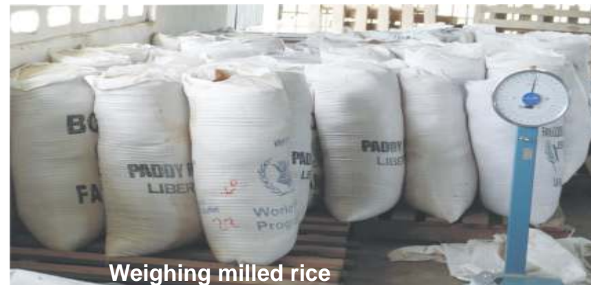
Weighing milled rice

-Govt. to double rice production by 2018