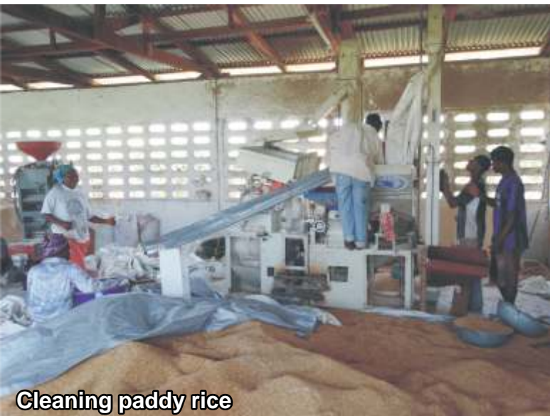
Cleaning paddy rice