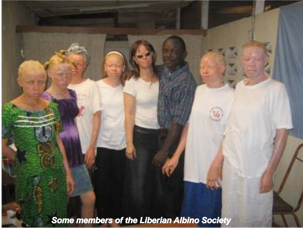
Some members of the Liberian Albino Society

L iberia's Vice President Joseph N. Boakai Saturday led an array of international human rights advocates, foreign dignitaries in launching an UN-backed resolution calling for the respect and human dignity for people with albinism in Liberia.