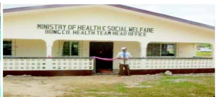
Gbonota Clinic Sanoyea District Bong County Health Team Head Office Phebe hospital